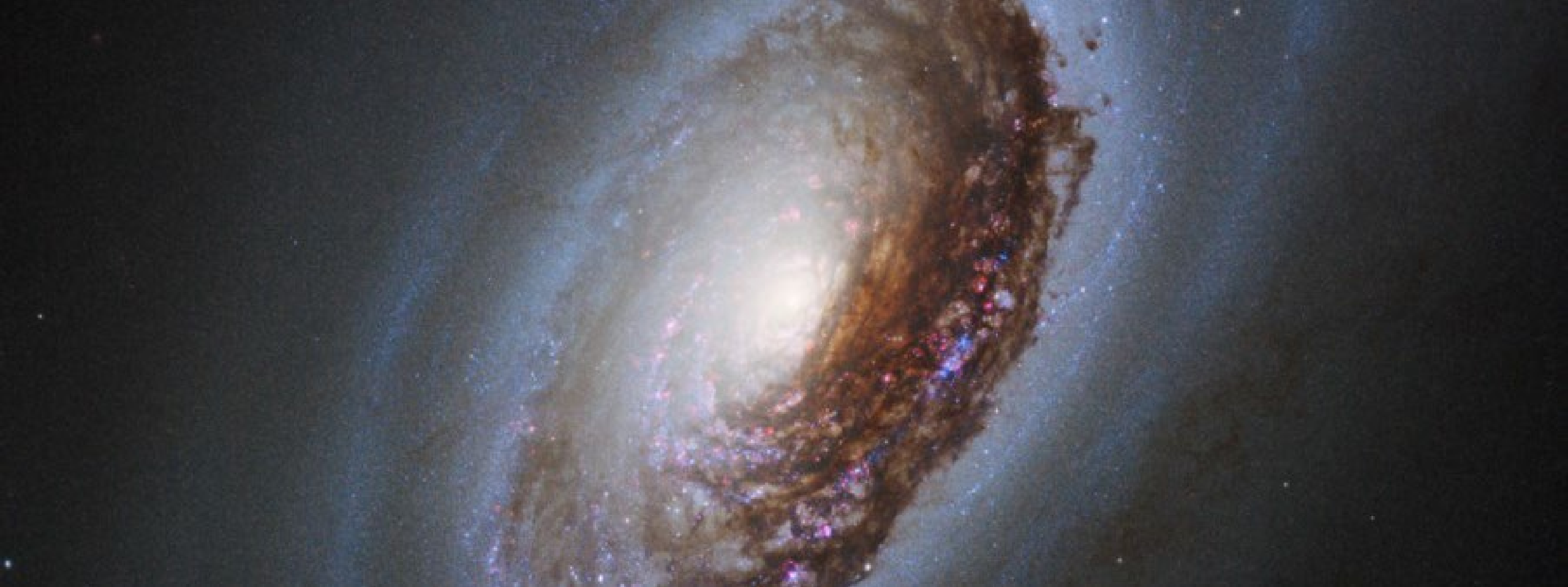
Black Eye Galaxy