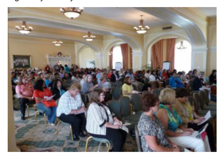
Literacy program leaders and TCALL staff attended a statewide Adult Education Administrators' Summer Institute in Galveston.

While most sustainability issues are discussed in terms of environmental efforts, it is equally important to ensure that adult citizens possess the basic literacy skills to be self-sustaining throughout their lifetimes. To support those efforts, the Texas Center for Advancement of Literacy and Learning (TCALL) in the College of Education and Human Development at Texas A&M University works with a variety of state and local entities to support literacy programs including family literacy.