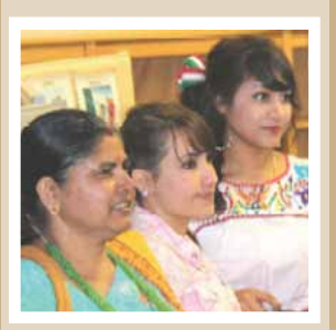
From 17 to 70: From Mexico to China ( Page 19 )