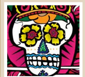
The Cemetery Project (Page 8)